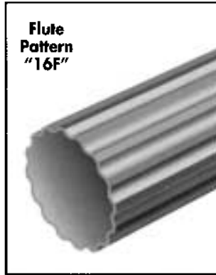
Flute Pattern "16F"

Pole: Fluted poles are formed from tubes conforming to the ASTM A595 process with a constant linear taper of 0.14"/ft. The wall thickness is available in 11 ga. (0.1196") or 7 ga. (0.1793"). The tube's seam weld is formed by the Electric Resistance Weld (ERW), and is smooth with no visual appearance.